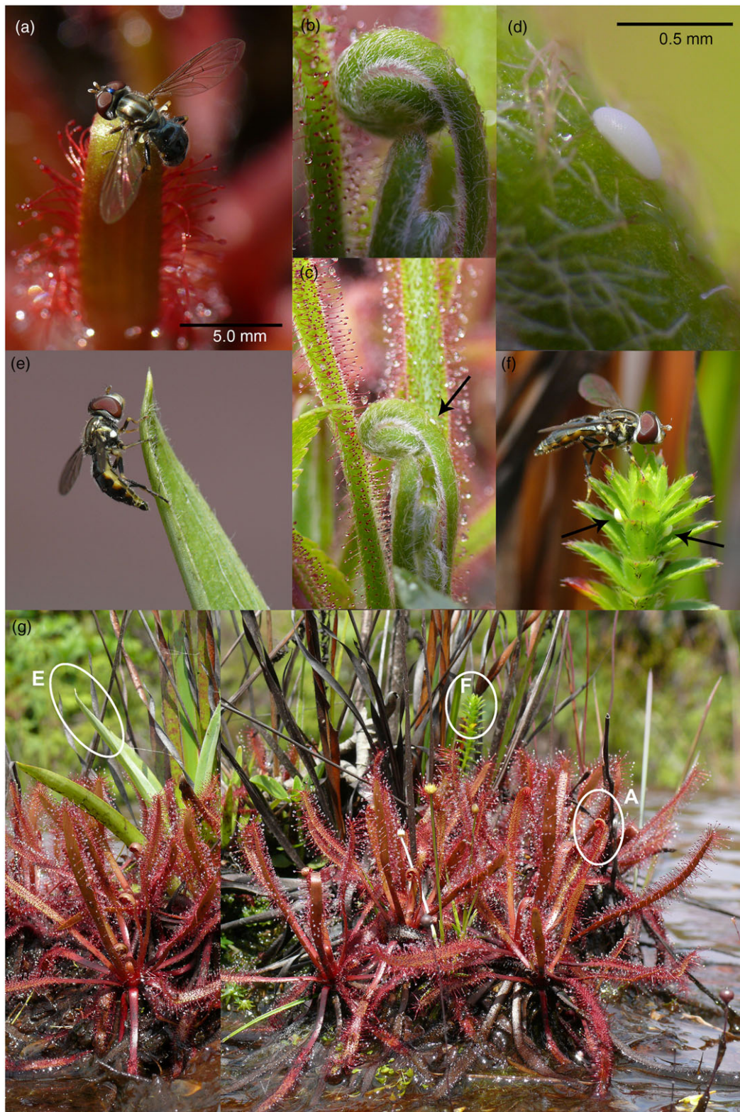
Figure 1. Oviposition of Toxomerus basalis . (a) female ovipositing on the tip of the abaxial (lower, non-carnivorous) surface of a developing leaf of Drosera latifolia . (b)–(d) Freshly deposited egg attached to the abaxial (lower) surface of an unfolding leaf of Drosera magnifica . (e)–(f) same female individual as pictured in (a) on plants growing in close proximity to Drosera . (e) Probing a leaf of Ericaulon sp. (Eriocaulaceae) – oviposition did not occur. (f) After oviposition on Microlícia sp. (Melastomataceae), with freshly laid egg visible (left arrow) – the same plant already held another Toxomerus egg (right arrow). (g) Overview of a colony of Drosera latifolia and associated plants, with oviposition sites documented under a, e, and f indicated. Image combined from two different photographs showing two different sides of that vegetation island that was patrolled by the Toxomerus basalis female. a, e–g: Diamantina, Distrito de São João da Chapada, Rio das Lajes, Minas Gerais, Brazil, 06 December 2018. b–d: summit of Pico do Padre Ângelo, Conselheiro Pena, Minas Gerais, Brazil, 04 December 2018.