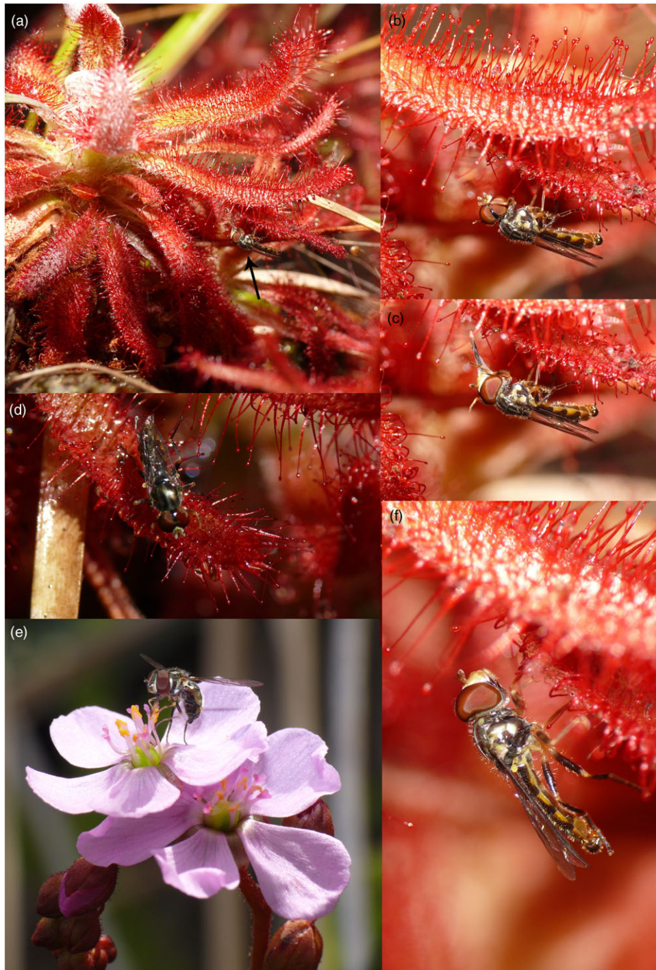
Figure 4. Biology of Toxomerus basalis adult flies associated with Drosera , documented in situ in Minas Gerais, Brazil. (a)–(d) + (f) Adult male sheltering beneath a leaf of Drosera graomogolensis during rain shower, Grão Mogol, Minas Gerais, 08 December 2018: (a)–(c) resting and showing cleaning behaviour, (d) leaving its carnivorous refuge by crawling over the sticky (yet rain-washed) leaves. (e) adult female feeding on pollen from a flower of Drosera latifolia , Rio das Lajas, 06 December 2018.