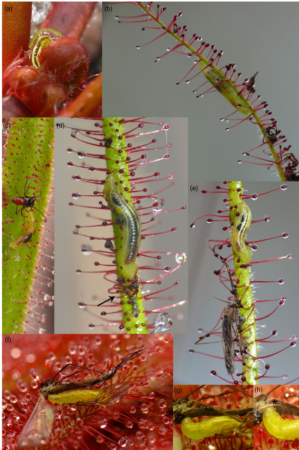
Figure 3. Biology and feeding habit of Toxomerus basalis larvae on Drosera leaves, documented in situ in Minas Gerais, Brazil (see also video material in the Electronic Appendix to this article). (a) L 3 larva hiding in the rosette centre of Drosera upon disturbance. (b) L 3 resting on the abaxial leaf tip. (c) L 2 larva approaching a captured, still-alive spider, not feeding on it as the prey is not yet fully immobilized. (d) L 3 feeding up a small, captured prey item, note where the tentacles have bent around the prey (arrow) but not commenced its digestion, as the tentacles heads have not yet darkened. (e) L 3 larva crawling to captured, immobilized nematoceran prey. (f)–(h) L 3 feeding on an immobilized but still living nematoceran that had been freshly placed on a leaf of Drosera graomogolensis (tentacles have not yet started bending over the prey), Botumirim, Rio do Peixe, Minas Gerais, 09 December 2018. * indicates anterior respiratory process visible during feeding. a on Drosera latifolia , Rio das Lajes, 06 December 2018. b, d, e on Drosera spiralis , Parque Nacional das Sempre Vivas, 06 December 2018. c on Drosera magnifica , summit of Pico do Padre Ângelo, 04 December 2018.