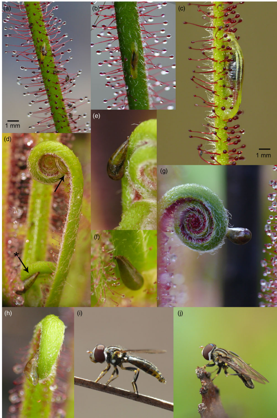
Figure 2. Life cycle stages of Toxomerus basalidis documented in situ in Minas Gerais, Brazil. (a) first-instar larva L_1 (b) L_2 larva (c) L_3 larva, figures 1a–c to the same scale. (d) L_3 larva attaching to pupate on a freshly enrolling Drosera leaf (arrow), note another puparium (arrow with *) on a developing leaf in bud on the same plant. (e) Puparium. (f) L_3 larva starting to pupate on a leaf base. (g) Puparium with emerging pharate adult – note the translucent puparium exoskeleton with opening fissures visible at the anterior end. (h) empty puparium exuvia on a developing Drosera leaf. a–c on Drosera spiralis , Parque Nacional das Sempre Vivas, Buenópolis, Minas Gerais, 06 December 2018. d–h on Drosera magnifica , Pico do Padre Ângelo, Minas Gerais, 04 December 2018. (i) + (j) adults resting on exposed perches near their Drosera hosts: (i) female, Rio das Lajes, 06 December 2018. (j) male, summit of Pico do Padre Ângelo, 04 December 2018.