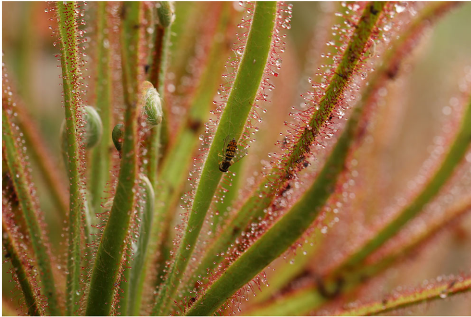
Figure 6. A female of Toxomerus lacrymosus apparently captured by the sticky tentacles of Drosera magnifica on Pico do Padre Ângelo, but which escaped on lower leaf surface. Note a syrphid egg (probably from T. basalis ) on the same leaf, right above the female.