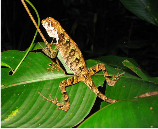
Figure 1. Enyalius catenatus , photographed in Serra Bonita.

(Porto et al. , 2013). While it is mostly found in humid forests it can also occur in dryer forest enclaves as e.g. in the Chapada Diamantina (Freitas, 2011). It shows arboreal habits and is often found at a height of 3-5 meters but can also be found on the ground (Vanzolini, 1972).