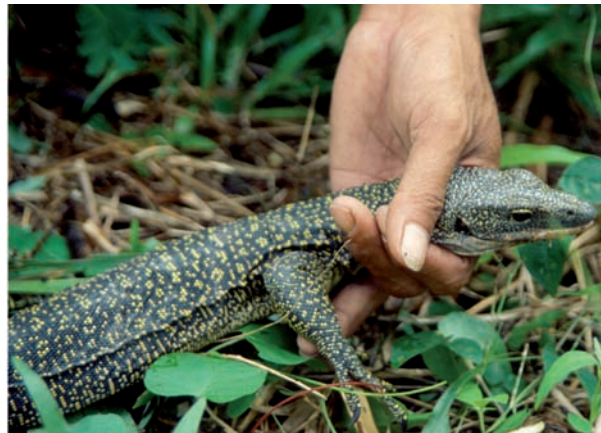
Fig. 14. Varanus sp. from Salibabu Island.

Material examined: MZB Lac. 5176 (AK067), MZB Lac. 5177 (AK064), MZB Lac. 5178 (AK059), MZB Lac. 5179 (AK066), MZB Lac. 5180 (AK065); MZB Lac. 581 (954),