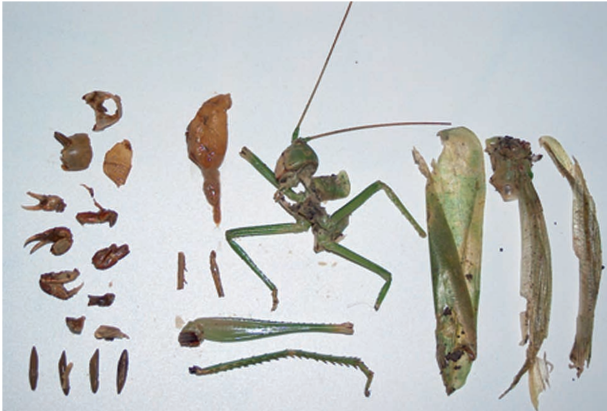
Fig. 15. Defecated prey remains from specimen MZB Lac. 5178 of Varanus sp. representing a large orthopteran ( Sexava sp., Tettigoniidae) and fragments of a crab.

tion of different age groups in the Talaud monitor lizards. While juvenile specimens seem to hide in thicket on the ground, adults obviously prefer a semi-arboreal life. The avoidance behaviour of juveniles seems reasonable because cannibalism is common in many monitor lizard species.