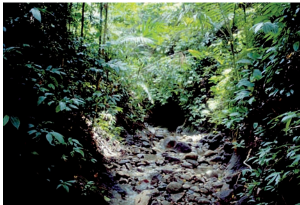
Fig. 4. Undisturbed riverine habitat upcountry of Salibabu Island. Habitat of Limnonectes sp. and an unidentified snake species.

forested. Surveys were done throughout all hours of day and early night. Specimens were mainly collected manually and with the assistance of a local villager. Voucher specimens were photographed prior to and after euthanization and preserved in 70 % ethanol. They are deposited in the Zoological Museum in Bogor (MZB). Tissue samples of monitor lizards were taken for molecular investigations and preserved in 95 % ethanol. Photographic vouchers are deposited in the private photo collections of AK and EA.