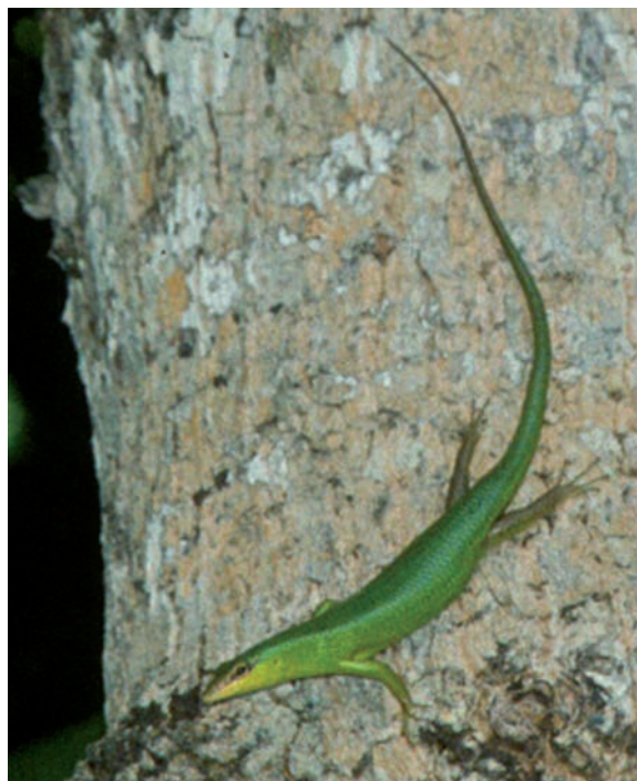
Fig. 13. Lamprolepis smaragdina ssp. from Salibabu Island.

Additional material: ZMA 11304 (1 spec.), Karakelang (= Karakelong), coll. H. J. LAM 1926; ZMA 18231 (1 spec.), Liroeng (= Lirung), Salibabu, coll. H. J. LAM 1926.