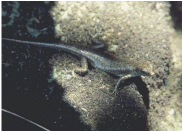
Fig. 10. Emoia a. atrocostata from Salibabu Island.

Distribution: According to BROWN (1991) the Talaud population of E. atrocostata belongs to the nominotypic subspecies. He examined one specimen from Karakelong (RMNH 18659). This coastal skink species is widespread ranging from the Philippines through the Indo-Australian Archipelago and many Pacific island groups such as the Carolines and Palau reaching North Australia. This is the first record of E. a. atrocostata for Salibabu Island.