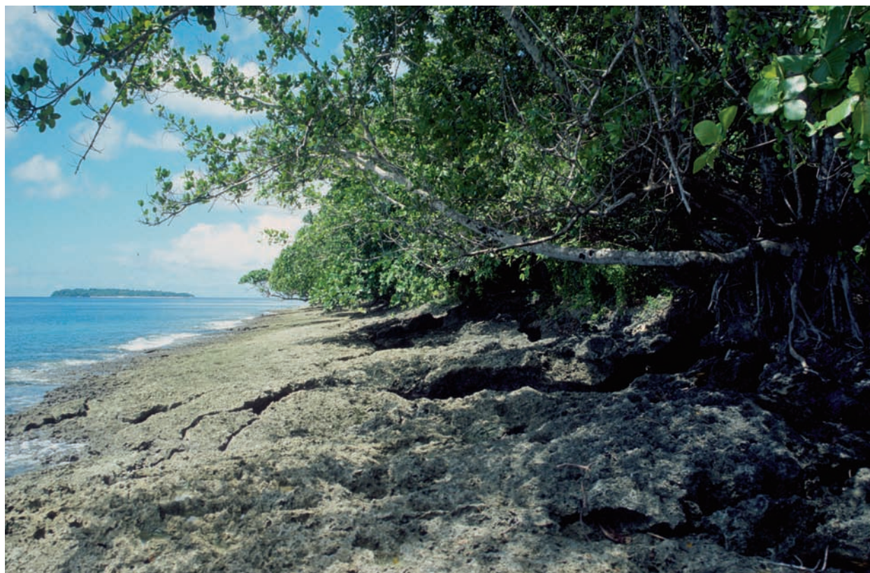
Fig. 2. Coast line with coral limestone deposits on Salibabu Island. Habitat of Varanus sp. and Emoia a. atrocostata .

The geographically isolated position between three biogeographic subregions in the centre of the Indo-Australian Archipelago render the Talaud Islands an interesting field of research for biogeographers. Until recently, however, the Talaud Archipelago (together with Sangihe) has been one of the least-known areas of the Sulawesi region as defined by VANE-WRIGHT (1991). Hence, due to their minor geographic size together with their remote location, the Talaud Island group has been paid only little attention by herpetologists in the past and scientific literature about the herpetofauna of this small archipelago is scarce. VAN KAMPEN (1907; 1923) and DE ROOIJ (1915; 1917) provided the first herpetological data about the Talaud Islands based on material collected by M. WEBER during the Siboga Expedition of 1899. DE ROOIJ (1915; 1917) listed five different lizard species ( Calotes jubatus , Varanus indicus , Lygosoma cyanurum , Lygosoma rufescens , and Mabuia multicaarinata ) and one snake species ( Candoia carinata ). Later, DE JONG (1928) published the results of another small collection by the Dutch botanist H. J. LAM who visited Karakelong and Salibabu as well as Miangas, a small islet south of Mindanao, in 1926 (LAM 1926; 1942). His Talaud collection comprised ten different species representing eight lizards and two snakes. Voucher specimens by M. WEBER and H. J. LAM from the Ta-