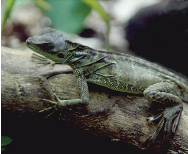
Fig. 8. Hydrosaurus sp. from Salibabu Island.

with six groups of two to six tubercular, carinate scales; three further such enlarged scales along the side of the neck; towards the ventral side numerous enlarged, smooth scales arranged in more or less distinct transverse rows; ventral scales homogenous, smooth; subdigitals under fourth toe small at basis, followed by 35 relatively enlarged subdigitals after first phalanx; toes laterally with a row of extremely wide (up to 1.9 mm) scales, 36 at fourth toe forming a serrated edge. Ten and eleven femoral pores, respectively. Ground color green to brownish with enlarged scales of the dorsal and lateral side being lighter; ventral side whitish, throat darker.