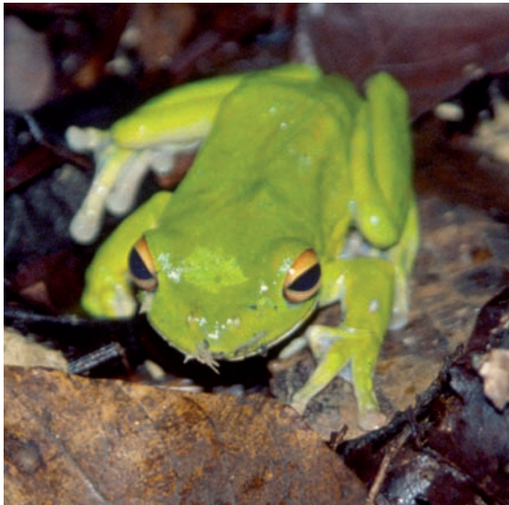
Fig. 5. Litoria infrafrenata from Salibabu Island.

Additional material: MCZ A-24288, Karakelong, coll. FAIRCHILD Garden Expedition 1940; ZMA 8570 (3 spec.), Lirung, Salibabu, coll. M. WEBER 1899; ZMA 8576 (1 spec.), Beo, Karakelong, coll. M. WEBER 1899.