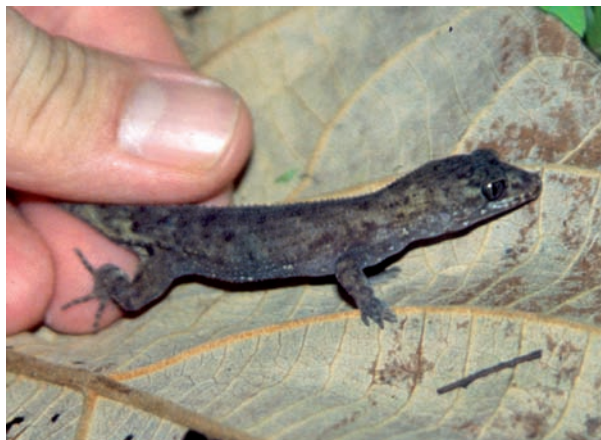
Fig. 9. Nactus cf. pelagicus from Salibabu Island.

Morphology: SVL 54 mm; tail regenerated, 55 mm long, fifth toe of left hind limb missing; probably a female, pre-anal pores missing; dorsum, limbs and tail (except for regenerated part) covered with granules and conical tuber-