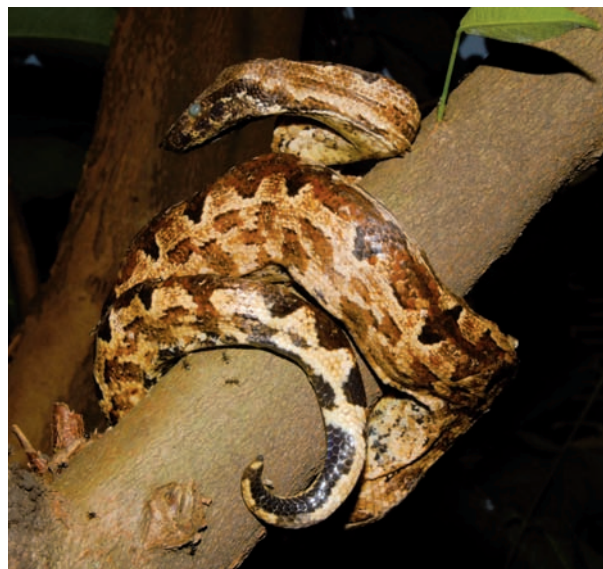
Fig. 16. Candoia paulsoni tasmai (MZB Serp. 2950) from Karakelong Island.