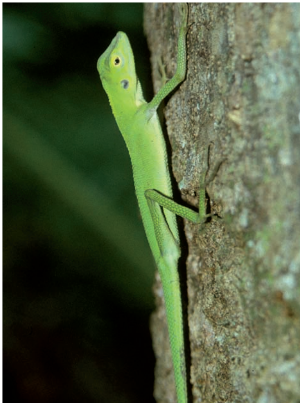
Fig. 7. Bronchocela cristatella from Salibabu Island.