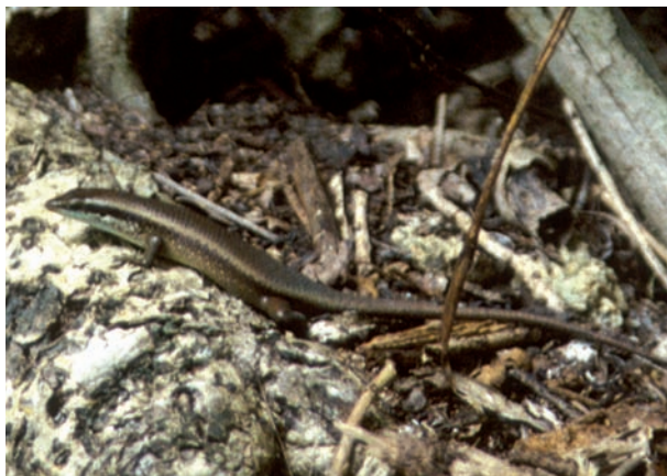
Fig. 11. Eutropis m. multicarinata from Salibabu Island.

Additional material: ZMA 18454 (1 spec.), Beo, Karakelong, coll. M. WEBER 1899.