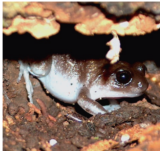
Fig. 6. Callulops cf. dubius from Salibabu Island.

Morphology & Taxonomy: Characteristically short-snouted, small frogs with short limbs: SVL 23.0–39.6 mm, TiL 9.5–15.5 mm; dorsally uniform dark brown to gray-