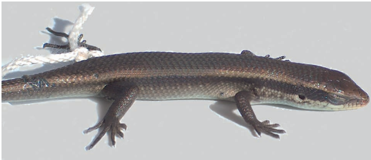
Fig. 12. Eutropis cf. rudis from Salibabu Island. Photo by André Koch.

& ALCALA (1980) in having 20 and 22 keeled lamellae under fourth toe, 32 and 30 midbody scale rows (usually 28–30, rarely 31 or 32; 28–31 in E. rudis from Sulawesi according to HOWARD et al. [2007]), respectively. A postnasal is present. The hind limbs of MZB Lac. 5142 reach the axilla as postulated by DE ROOIJ (1915), while MZB Lac. 5113 exhibits tricarinate dorsals as typical for E. rudis . The second specimen's dorsal scales have up to five keels (very rarely in E. rudis according to BROWN & ALCALA [1980]), of which the three medians are strongly pronounced and flanked by two feeble outer keels. The Talaud specimens share this character with the newly described E. grandis from Sulawesi (HOWARD et al. 2007), from which, however, they are clearly distinguishable by higher midbody scale counts (30–32 vs. 25–27 in E. grandis ). In contrast to BROWN & ALCALA (1980) and HOWARD et al. (2007) both vouchers have 40 paravertebral rows (vs. 34–38 in Philippine E. rudis and 34–35 in Sulawesi E. rudis , respectively) between parietals and base of tail. The dorsal side is brown, laterally with a dark brown streak starting behind the nostrils, bordered above by a light brown streak; ventral side light grey, supralabials also grayish. In specimen MZB Lac. 5113 the ventral side is light gray only on the first half of the body; the rest including hind limbs and tail is brownish.