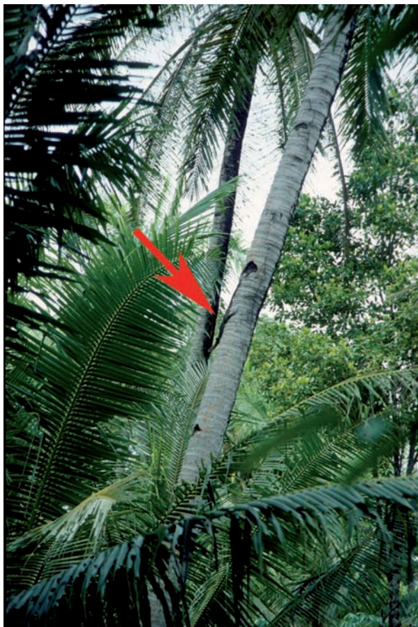
Fig. 3. Coconut and nutmeg plantations dominate the cultivated coastal landscape of Salibabu Island. Red arrow indicates Varanus sp. basking on a palm trunk.

Field studies on the east coast of Salibabu Island (ca. 95 km 2 ) were conducted by AK and EA from 13 to 21 July 2005. Collections and observations were made in the vicinity of Lirung, a settlement with a ferry landing stage. Field numbers are AK039 to AK075. The surroundings near the coastline are dominated by agricultural vegetation, especially coconut ( Cocos nucifera ) and nutmeg ( Myristica fragrans ) plantations (Fig. 3). The island's hilly interior was not intensively surveyed. In the low central hills, however, primary habitats or at least areas of minor disturbance still exist (Fig. 4). As recently recognized by RILEY (2002), and unlike the neighboring island Salibabu, large areas of Karakelong Island (ca. 970 km 2 ) are still