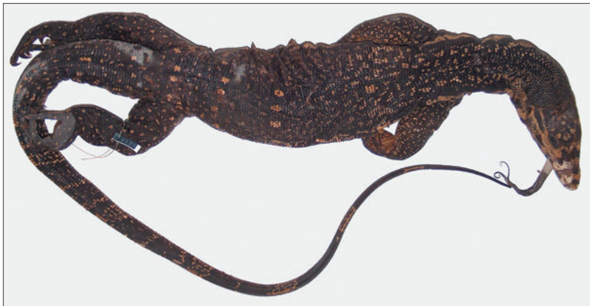
Fig. 5. A specimen of V. salvator ssp. (RMNH 3170) allegedly from Halmahera.

smaller adjacent island of Ternate due to ill health. Therefore, the locality data of Forsten's voucher specimens are not reliable and it is quite possible that the two water monitor specimens were caught on another neighboring island such as Tidore or Bacan. For the latter island V. salvator was already mentioned by Bleeker (1857). Interestingly, the Halmahera voucher specimens show some phenetic similarity with the typically-colored, i.e., spotted populations of V. salvator from North Sulawesi (Fig. 5), thus rendering a natural occurrence on Halmahera unlikely. Beyond that, several expeditions to Halmahera in recent years could not trace V. salvator (e.g., Setiadi and Hamidy, 2006; Weijola, 2010; A. Riyanto, personal communication). Thus, the origin of Forsten's Halmahera specimens can not unequivocally be determined.