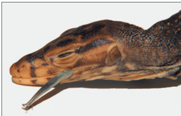
Fig. 3. Lateral view of the holotype specimen (SMF 56442) of V. salvator ziegleri ssp. nov. Note the light bluish-gray tongue.

Differential comparison with the other subspecies of V. salvator . Although Mertens (1959:237) did not recognize differences in coloration and pattern between water monitor specimens of the nominotypic population from Sri Lanka and the holotype from Obi, there are