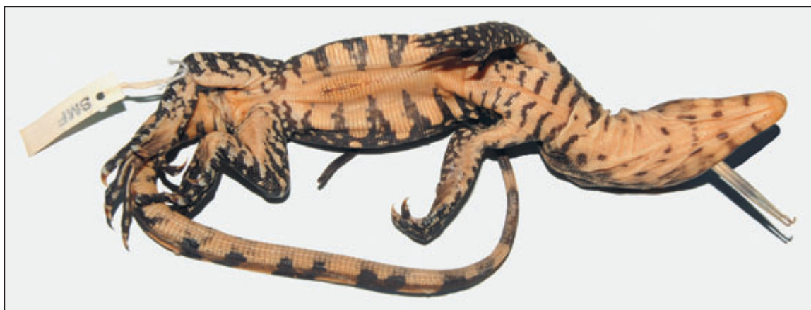
Fig. 4. Ventral view of the holotype specimen (SMF 56442) of V. salvator ziegleri ssp. nov.

In overall appearance, some populations of V. s. bivittatus (Kuhl, 1820) from Java and the Lesser Sunda Islands resemble the new water monitor lizard subspecies from Obi in the generally brighter colored head and neck regions. There are, however, some important differences. Dorsally, V. s. bivittatus often shows ocelli with a dark center (vs. spots) and a tendency towards fused cross bands instead of distinct transverse rows of