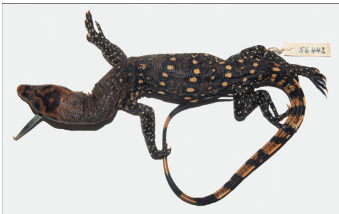
Fig. 2. Dorsal view of the juvenile holotype specimen (SMF 56442) of V. salvator ziegleri ssp. nov. showing the characteristic dorsal color pattern on the head in combination with a light olive-brown background color and dark-encircled large light spots arranged in transverse rows on the posterior half of the back.

lowing combination of characters: (1) a distinct dorsal color pattern on the head in combination with a light olive-brown background color and dark-encircled large light spots arranged in transverse rows on the posterior half of the back.